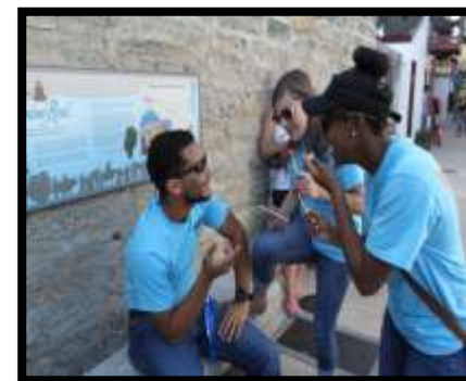
Team Building and Bonding