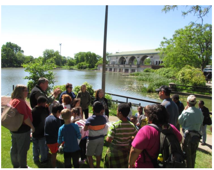
Students from Suder Montessori discuss the birds that they saw during their field trip to Humboldt Park.

This report describes the results of Birds in my Neighborhood in the 2016-17 school year, including successes, lessons learned, opportunities for improvement, next steps, and stories.