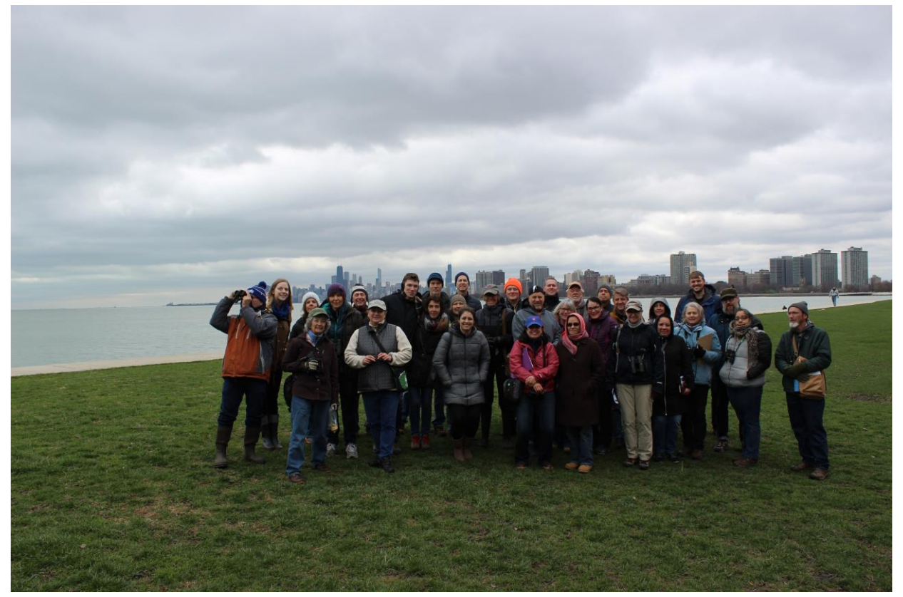
At the spring field trip training for new volunteers, everyone enjoyed a great day birding at Montrose Point.

"I went to one of the training classes as a refresher and reviewed the written material." - Volunteer