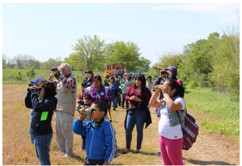
Peck Elementary students, parents and teachers on a field trip to Midewin Tall Grass Prairie

"A field trip that has more than two classes requires