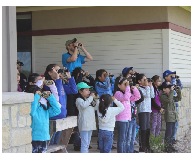
Testing binoculars with Peck Elementary students.

When asked, several teachers indicated that there are other teachers in their grade level would participate if invited (n=9).