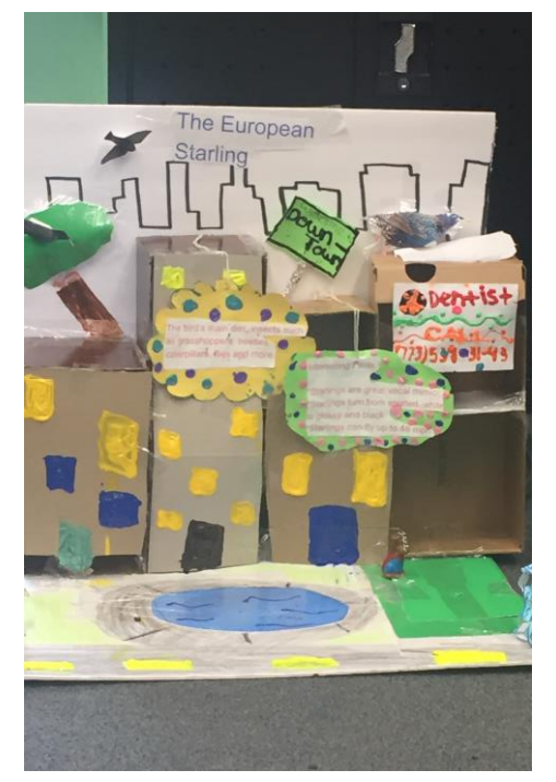
Starling diorama, by a student at Dirksen Montessori.

"The program is excellent and needs no improvement." - Jamieson Elementary teacher