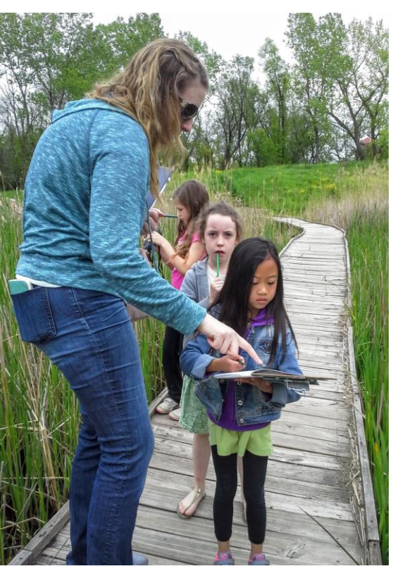
Edison Park Elementary Students record the birds they saw at North Park Village Nature Center, with help from their teacher.