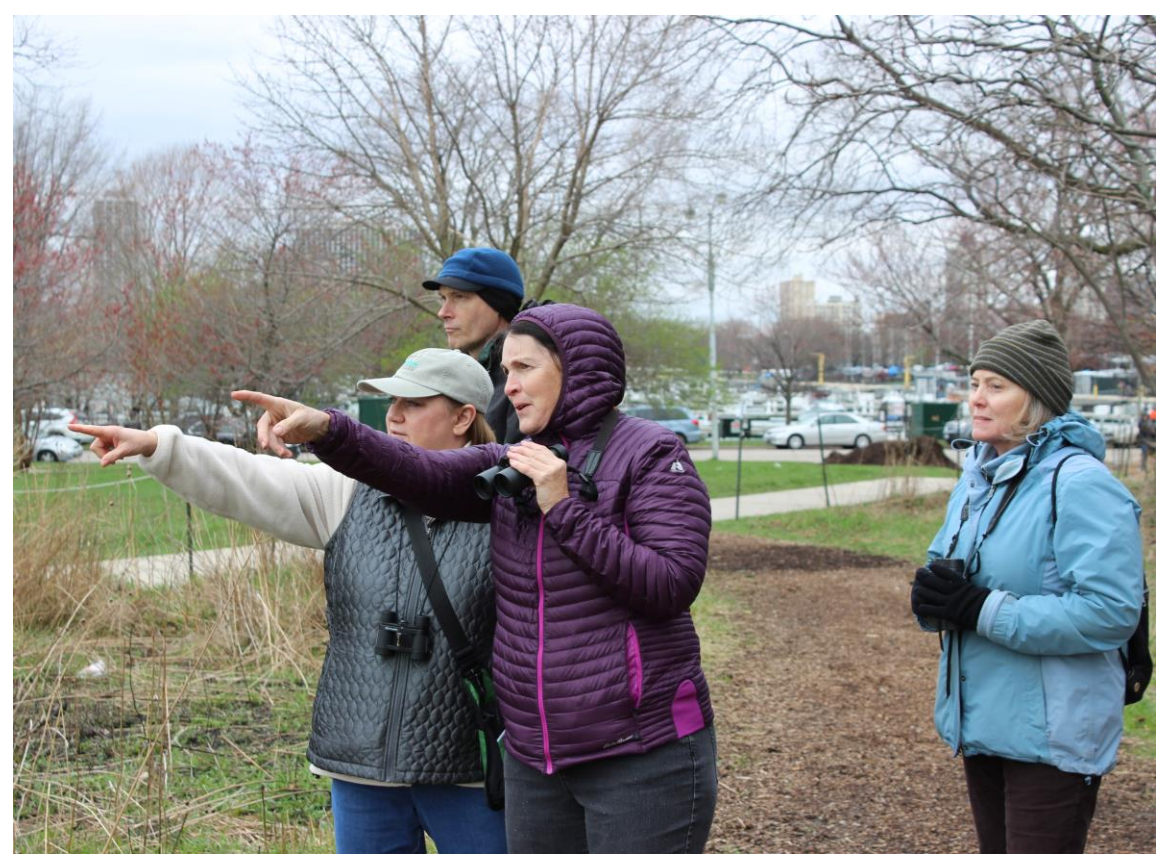
Birds in my Neighborhood volunteers point out birds at the field trip training at Montrose Point.