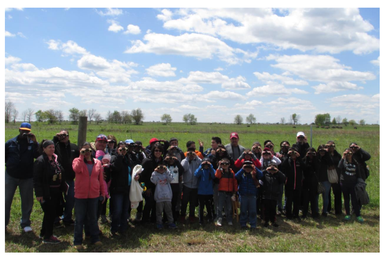
For teachers, students, and family members from Hearst Elementary, seeing the wild bison herd at Midewin was the grand finale of a birding adventure that included touring arsenal bunkers, observing grassland birds, and visiting the Midewin Bison Expedition.